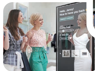
v Smart Retail