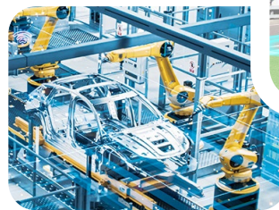
▼ Real-time AOI