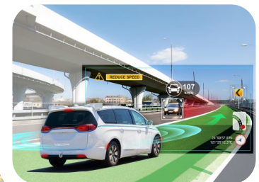
▲ In-Vehicle Computing