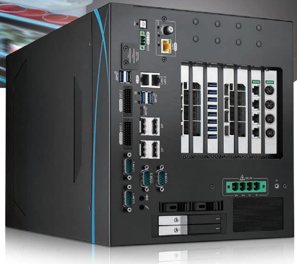
v Vehicle Computing