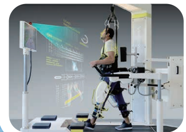
^ Deep Learning